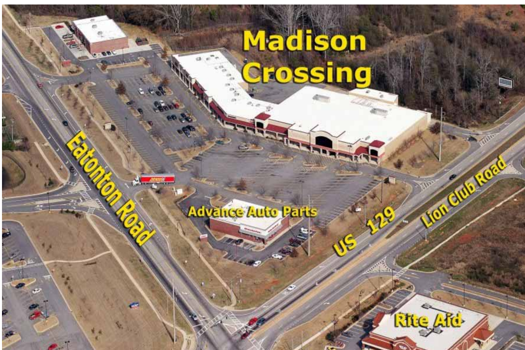
1700 Eatonton Road Madison, GA 30650