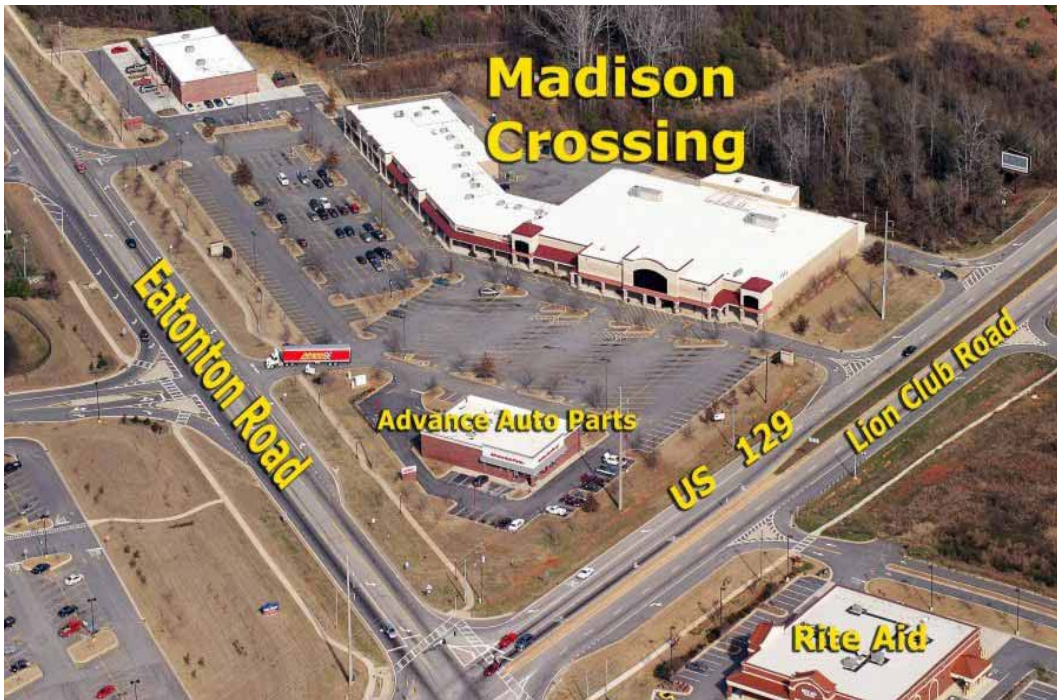
1700 Eatonton Road Madison, GA 30650