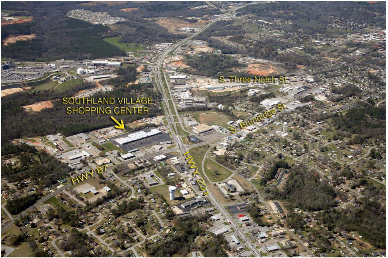
111 Southland Village Troy, Alabama 36079